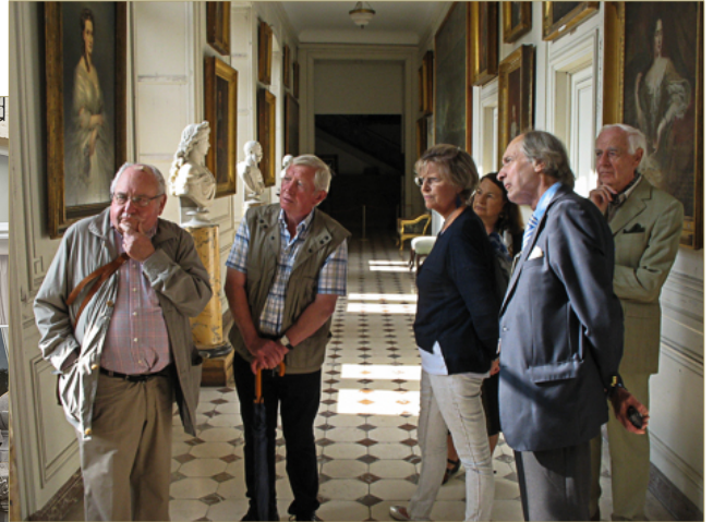
Château de Beloeil, September 2014