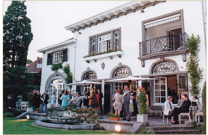
at the British Ambassador's Residence, Ukkell/Uccle