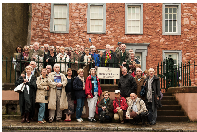
at Broughton House, Kirkcudbright, SW Scotland, 2011