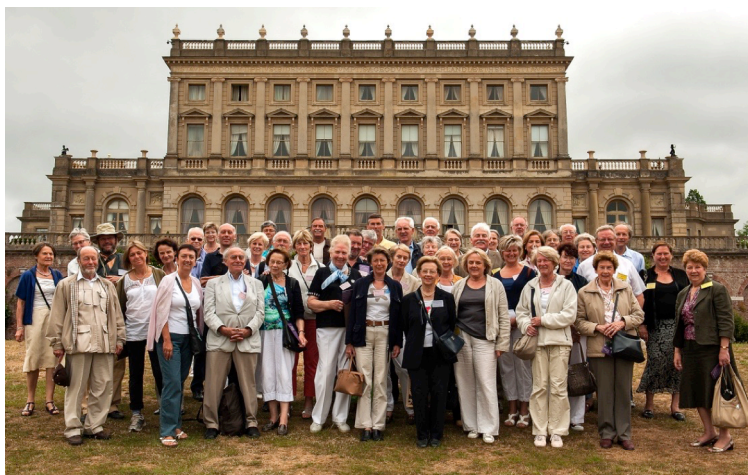
NTAB at Cliveden, Buckinghamshire – 2010

Each year we organize trips to NT properties in Britain. We also organize regular outings to places of interest in Belgium. These visits are guided in both English and the local language, Dutch or French.