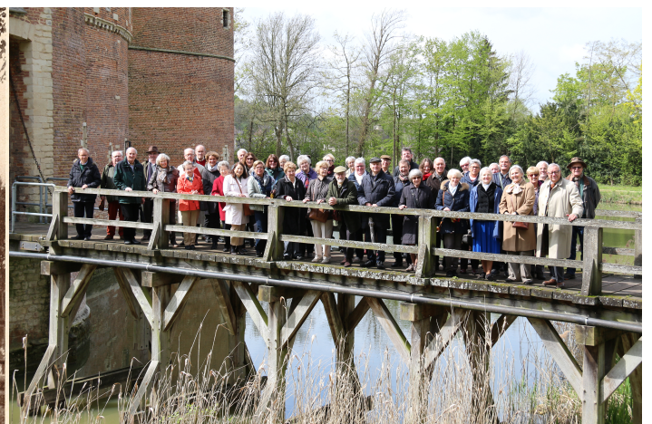
NT delegation on the bridge of the Castle of Beersel, 1939, and NTAB members on the same bridge, April 2017