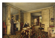
Carlyle House, Chelsea-London donation 2013 - visited in 2010 (Jane's sofa, see bottom right corner)