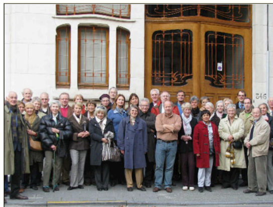
House Max Hallet, Brussels, 2008