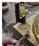
NTAB at Tankerdale's workshop in Petersfield, Hampshire, 2010