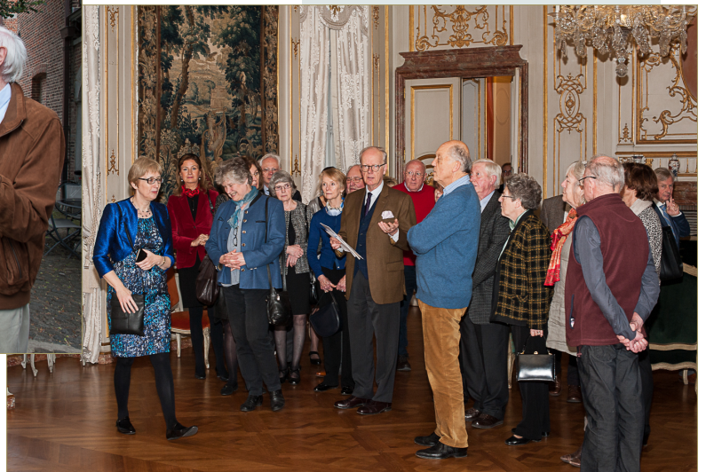
Egmont Palace, Brussels – End of Year Gathering, December 2015