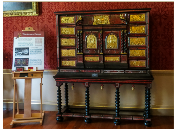
Conservation of the 17 th C Antwerp cabinet at Oxburgh Hall by Tankerdale, Petersfield (donation 2009)