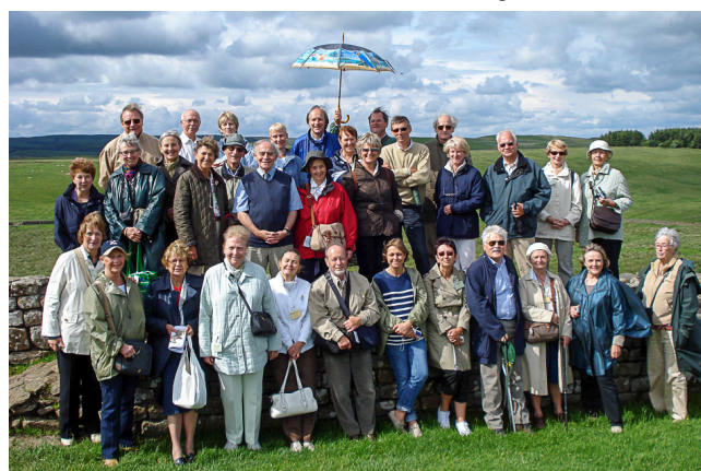
at Hadrian's Wall, Northumberland, 2007