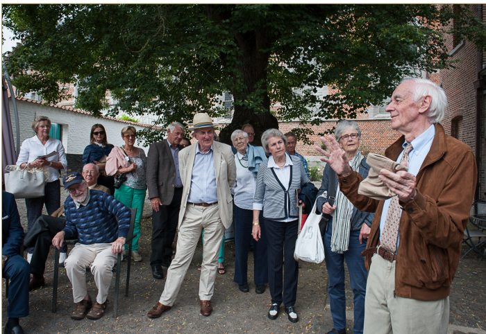
Lessines, Hôpital Notre Dame à la Rose, June 2016